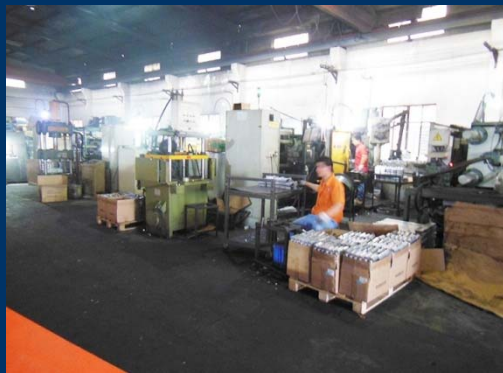
Zinc Alloy Die-casting