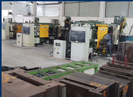
Aluminum Alloy Die-casting

Based on our manufacturing facilities and the local co-operating factories, we could do the sand castings, investment castings (lost wax castings), aluminum alloy die-casting, zinc alloy die-castings and forgings. We could also do the additional machining for these parts, and also the finish treatment (heat treatment, sand blasting & anodizing, polishing, powder coating, etc..) as well.